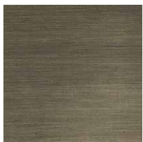
OBA | Bronzo Antico (In ottone) Antique Bronze (On brass)