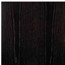
FRM | Frassino Moka Moka ashwood