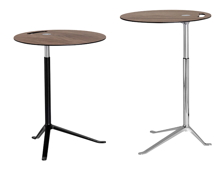
REPUBLIC OF Fritz Hansen®

The multi-purpose table Little Friend™ designed by Kasper Salto is a small yet significant piece of furniture in the history of Fritz Hansen. The ground-breaking design was the result of a series of a think tanks' ideas of new ways of working and living. Little Friend is a flexible, multifunctional and portable solution to the challenges of modern minimalist working and living. It is perfect for your laptop as well as your morning coffee.