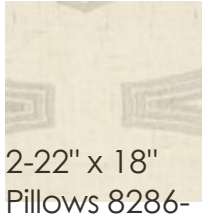
2-22" x 18" Pillows 8286- 89CC