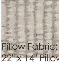
Pillow Fabric: 2- 22" x 14" Pillows 8273-71CC