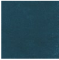
Body Fabric: 2680-09CC