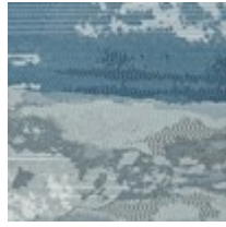
Pillow Fabric: 2- 21" x 21" Pillows 8335-09CC