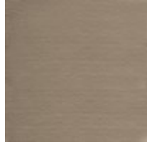
Pillow Fabric: 2- 33" x 15" Boxed Back Cushions with 2.5" Boxing 2467-71CC