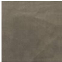
Body Fabric: 2301-92CC