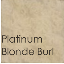
Platinum Blonde Burl