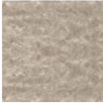
2-21" x 21" Pillows 2655- 74CC