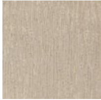
Body Fabric: 2656-74CC