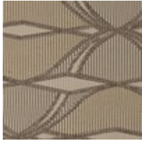
Pillow Fabric: 2- 22" x 22" Pillows 8308-93CC